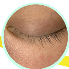
FINE AND SPARSE LASHES