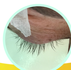
DIFFICULT EYES AND MISSING SHORT CRISSCROSS LASHES